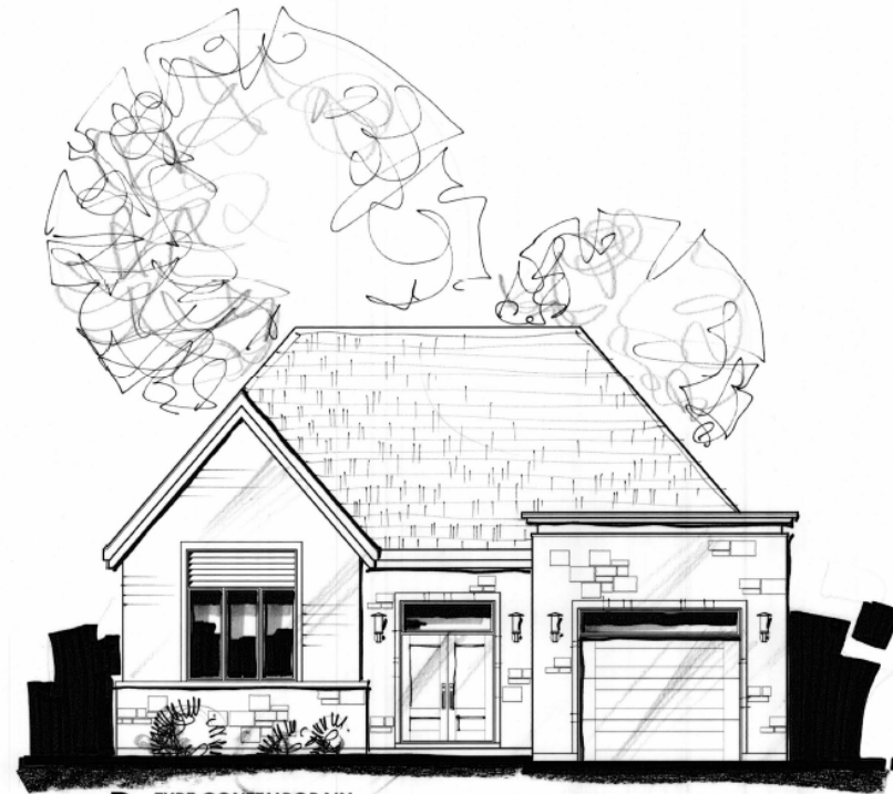
B TYPE CONTEMPORAIN CONSTRUCTION SYLVAIN PARADIS