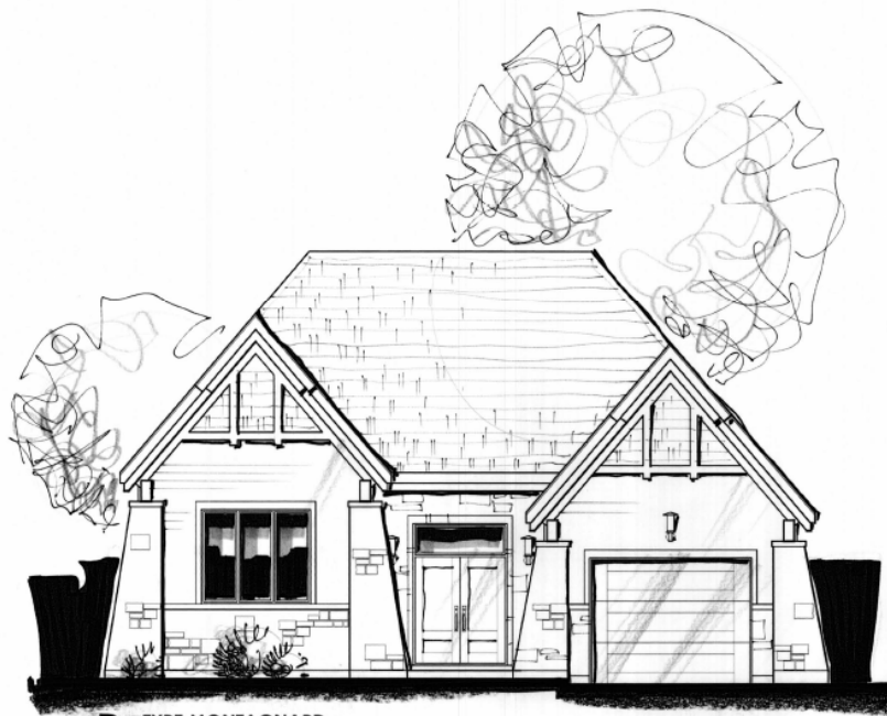
B TYPE MONTAGNARD CONSTRUCTION SYLVAIN PARADIS